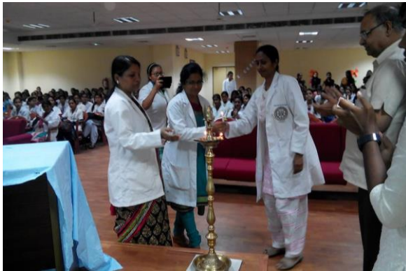
“World Suicide Prevention Day” inauguration of the program and lamp lighting