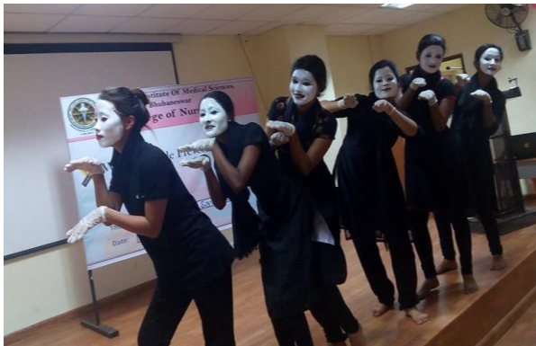
Mime by students of Nursing College on the theme “Reach out to save the lives”