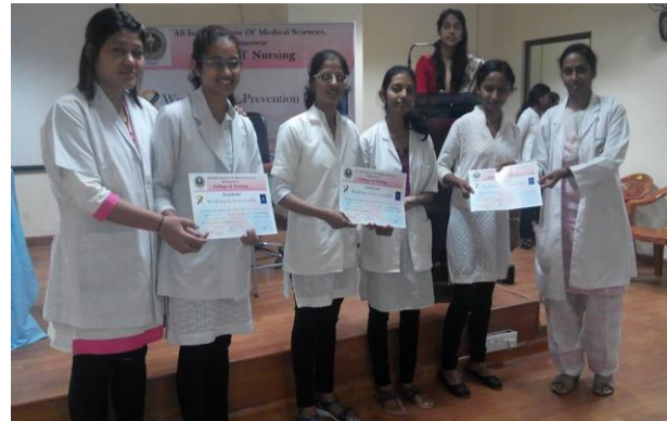
Distribution of prizes for Rangoli making